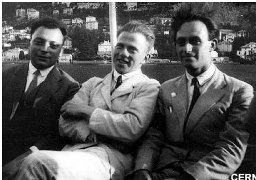
Wolfgang Pauli, Werner Heisenberg and Enrico Fermi, 1927, Lake Como

Exams: We will have three midterm exams and the final examination.