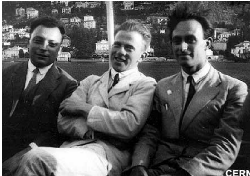
Wolfgang Pauli, Werner Heisenberg and Enrico Fermi, 1927, Lake Como

Exams: We will have three midterm exams and the final examination.