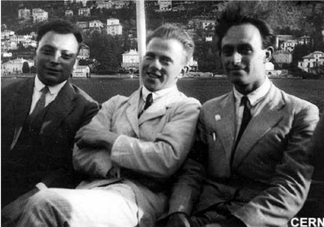
Wolfgang Pauli, Werner Heisenberg and Enrico Fermi, 1927, Lake Como