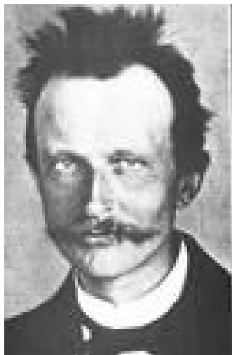
Max Planck in 1901

core of our understanding of the physical world. Thoroughly proven through a wide range of experiments, quantum mechanics has a beautiful logical structure that you will learn and enjoy by using it to solve problems. So while it may be true as Richard Feynman famously claimed that “nobody understands quantum mechanics”, you will learn to use it to explore a fascinating realm that classical intuition has not prepared you for.