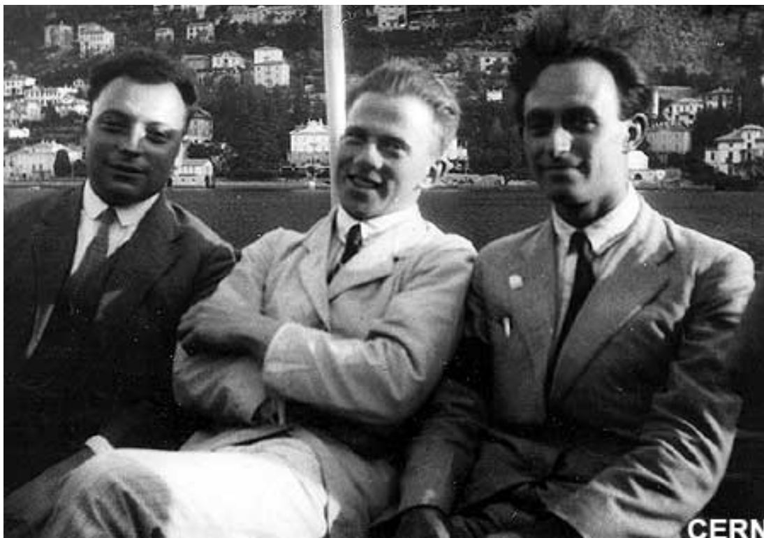
Wolfgang Pauli, Werner Heisenberg and Enrico Fermi, 1927, Lake Como