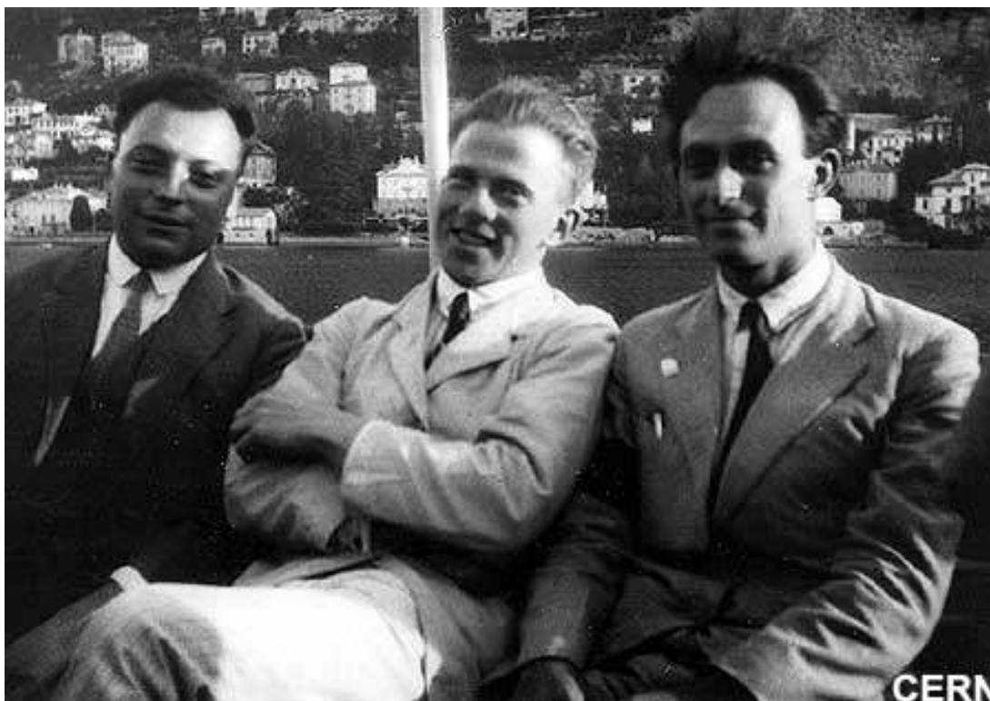
Wolfgang Pauli, Werner Heisenberg and Enrico Fermi, 1927, Lake Como

SYLLABUS: The syllabus describes the intended progression of the course. The syllabus will be revised as needed. Changes to the syllabus will be announced in class.